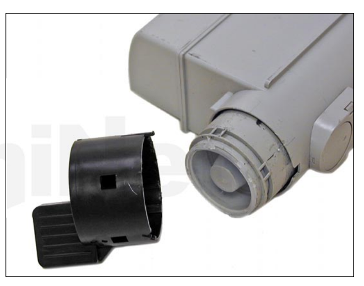
2. Remove the end cap.