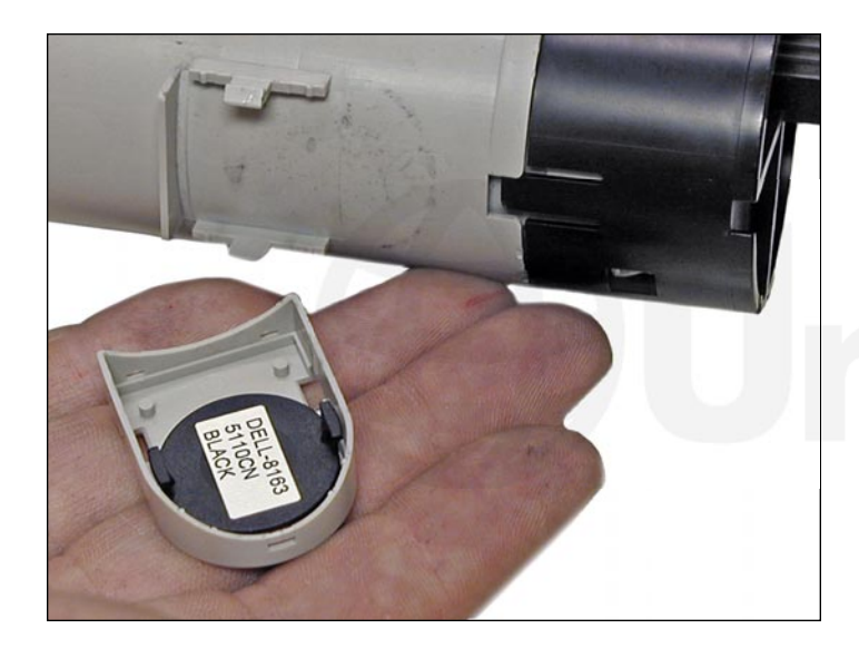
7. Separate the chip from the holder and replace the chip.