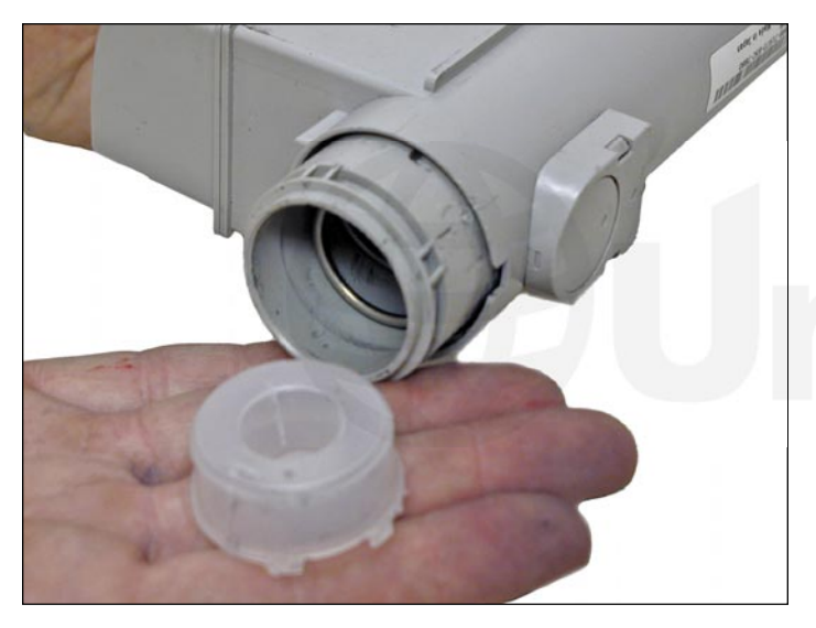
3. Very carefully pry out the fill plug.

Tthe plug is very soft and easily damaged!