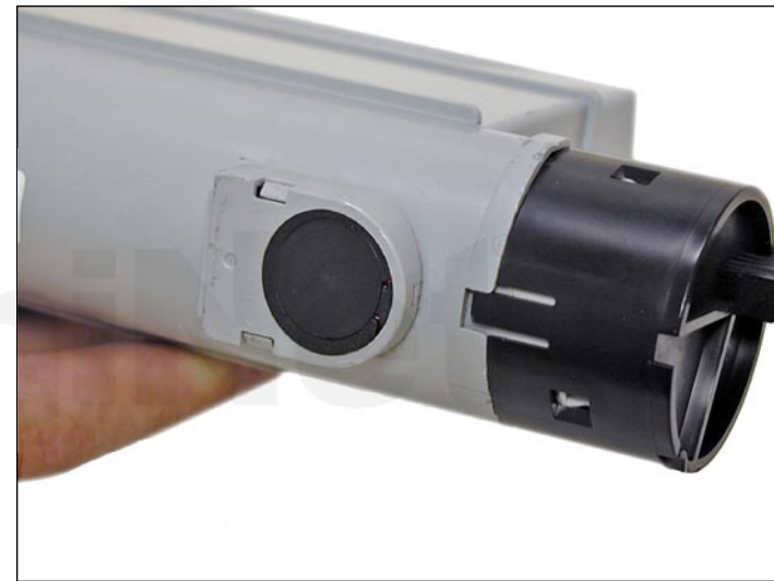
8. Snap the chip holder back on the cartridge.