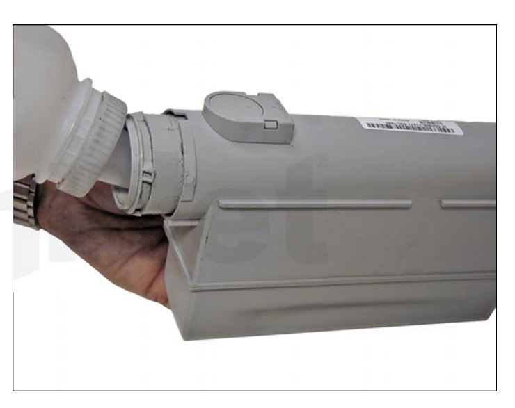
4. Remove all the old toner.

Tthe plug is very soft and easily damaged!