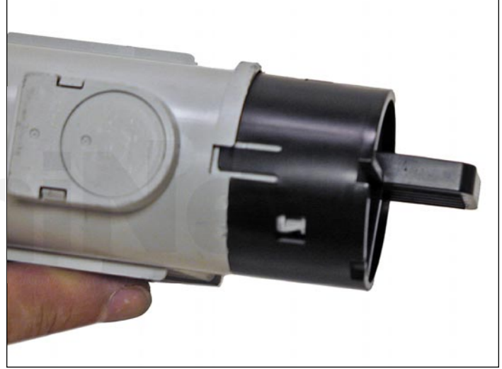
5. Replace the fill plug and end cap.